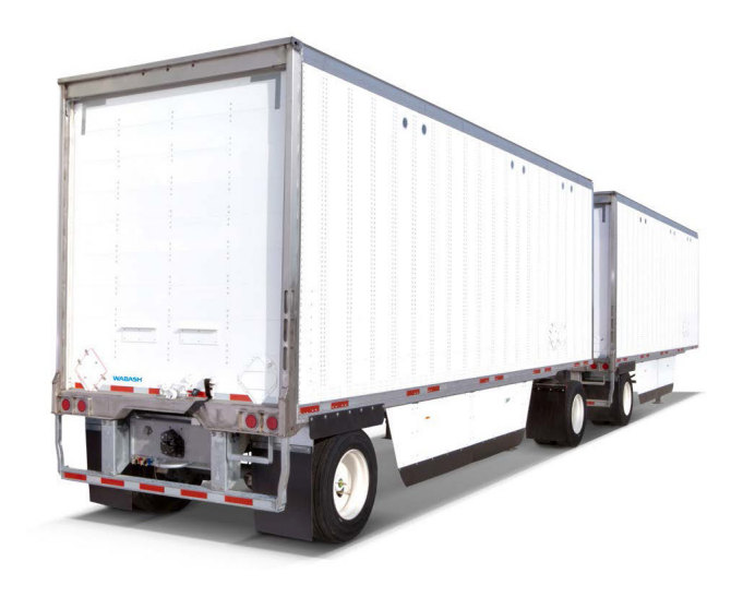
The LTL model reduces drag and lateral trailer movement to improve stability and fuel economy