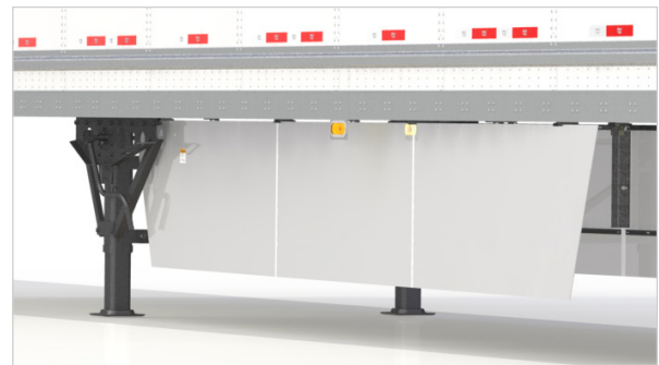
Impact and abrasion resistant – made with highly engineered composite panels for optimum flexibility, strength and durability