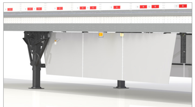
Impact and abrasion resistant – made with highly engineered composite panels for optimum flexibility, strength and durability.